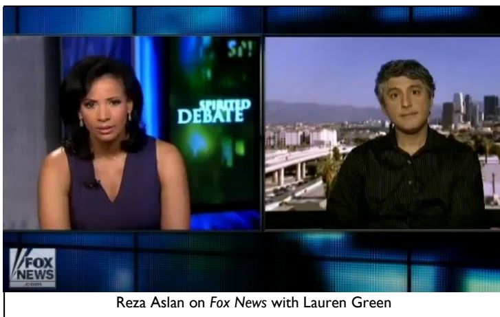
Reza Aslan on Fox News with Lauren Green

The basic premise of Zealot is there is little reliable historical information known about Jesus. In fact, Aslan states, "In the end there are only two hard historical facts about Jesus of Nazareth upon which we can confidently rely: the first is that Jesus was a Jew who led a popular movement in Palestine...the second is that Rome crucified him for doing so." ( Zealot p. xxxviii) Material from the Bible is generally discounted (unless it supports a view held by the author) as Aslan does not accept it as a historical reference.