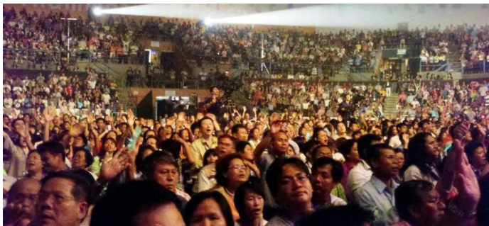
Thailand Congress on Evangelism

It is a privilege to serve on the leadership team of the Thailand Evangelism Committee and to provide input and direction to this meeting. During the congress I was able to share with the audience significant facts about the Thai church.